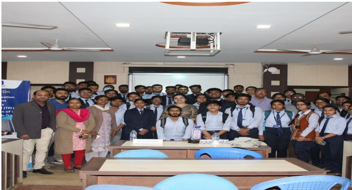
Mock Test Sessions on Aptitude Training & Verbal & Non Verbal Reasoning on 03.09.2022

The Institute has arranged Mock Test Sessions on Verbal and non-verbal Reasoning and Aptitude Training to improve students' logical and soft skills. The main goal of these sessions is to practice test sessions in order to improve technical skills and promptness. The examinations were administered every month from August through December. 728 students in total benefited from this program. Identity Training Services Pvt. Ltd., a vendor, delivered the instruction.