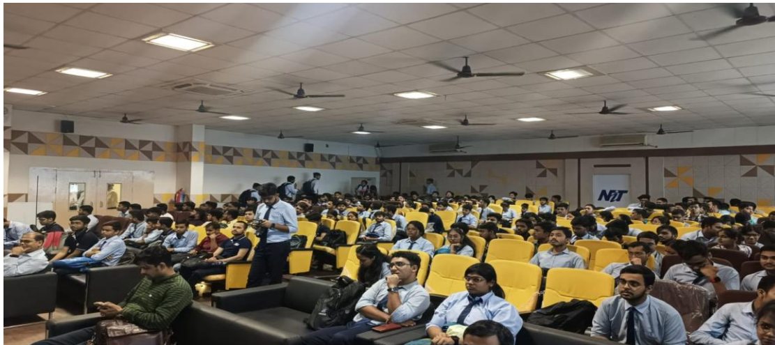
Training on Aptitude & Verbal & Non-Verbal Reasoning Test on 08.08.2022