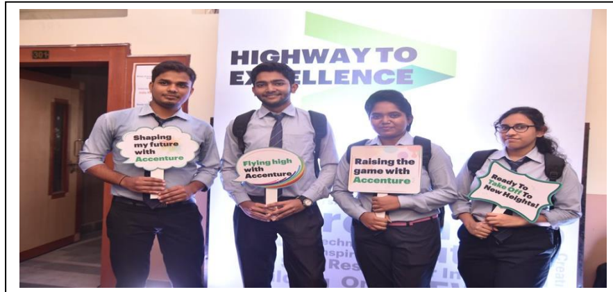
Pre placement Talks: Accenture on 15.03.2023

Pre-placement seminars were arranged by the Institute to educate students about various organizations. Throughout the years 2022–2023, our college was visited by several well-known businesses, including TCS, IBM, Hexaware, CTS, Persistent, Genpact, Wipro, Simplex Infrastructure ITC Infotech, Vastu Vihar Ltd, Indian Navy Asahi India Glass Ltd, Subex, Think & Learn Pvt. Ltd, Hitachi Consulting Software Services India Pvt. Ltd, Capgemini, Poornam, and Xpanxion (UST Global). The institute's Training and Placement cell coordinated these discussions centrally. The relevant company dignitaries served as the events' resource people. 728 students in all attended the talks.