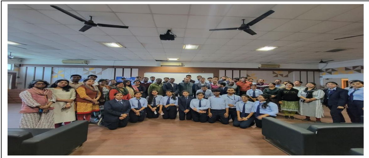
Seminar on AI/ML Based Smart Systems for Energy, Healthcare, and Agricultural Industries on 09.02.2023