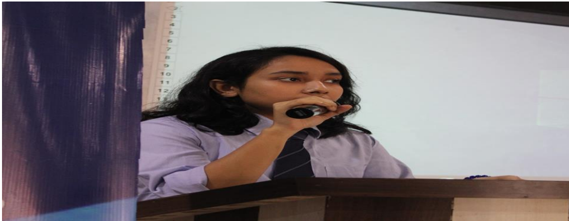
Mock Interview Sessions on 16.09.2022