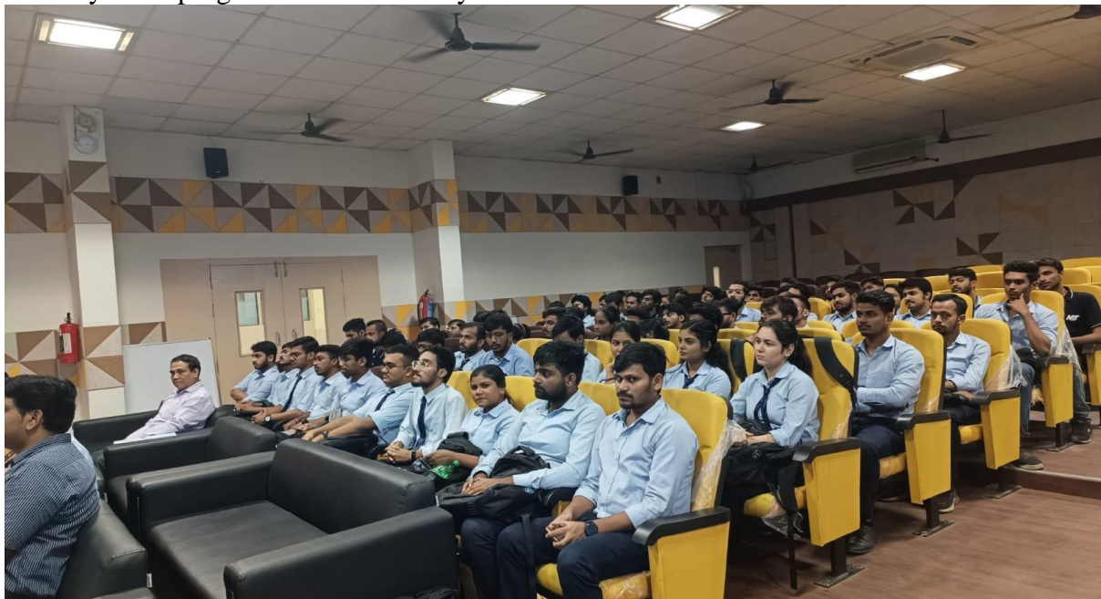
Training class for competitive exam GATE on 07.09.2022

For the entire semester (August to January), Narula Institute of Technology has arranged training workshops for all final and pre-final year students across all departments to gain the capacity to solve a variety of problems for the GATE (Graduate Aptitude Test for Engineers). Several professors from other departments used to deliver these training sessions virtually. The program was attended by 259 students.