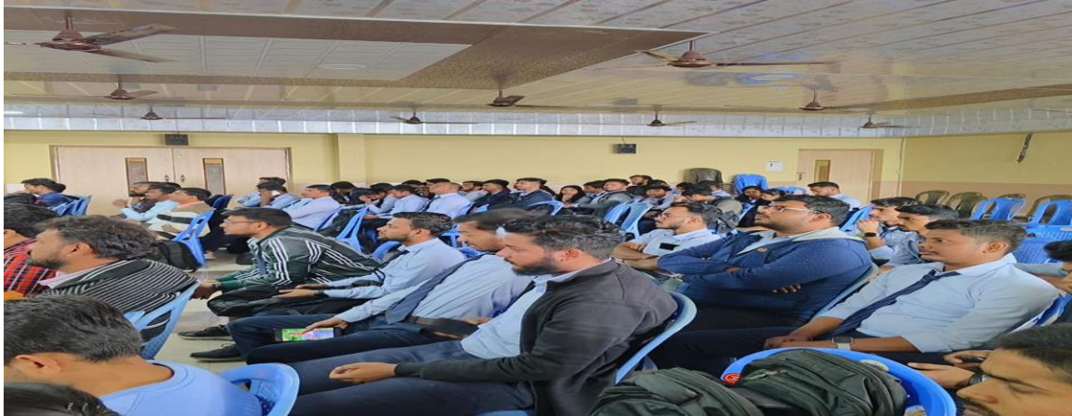
Training class for competitive exam UPSC/IES on 28.01.2023