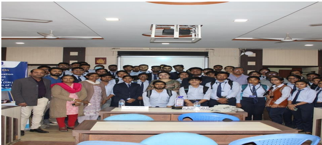
Training class for competitive exam GRE on 10.02.2023