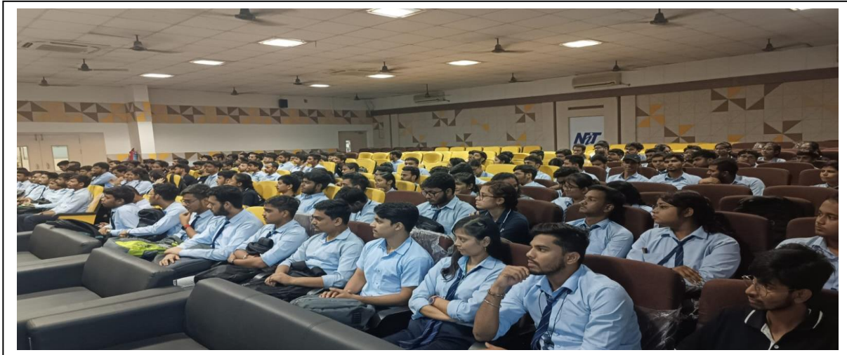
Seminar on Advance Material and their Characterization on 30.09.2022