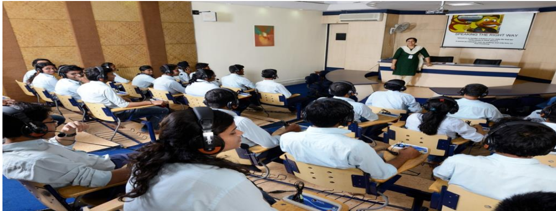
Training class for competitive exam IELTS on 10.03.2023