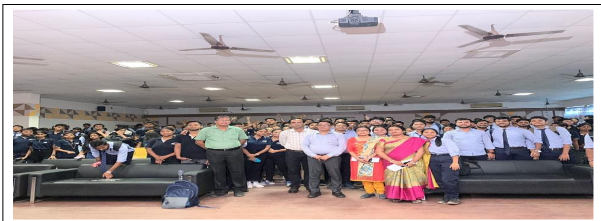
Session during the Early Stage Entrepreneurs on 22.09.2022