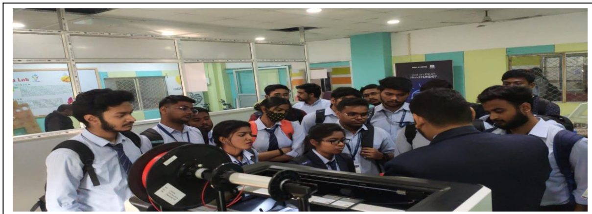
Workshop on remote sensing of landslide on 09.11.2022